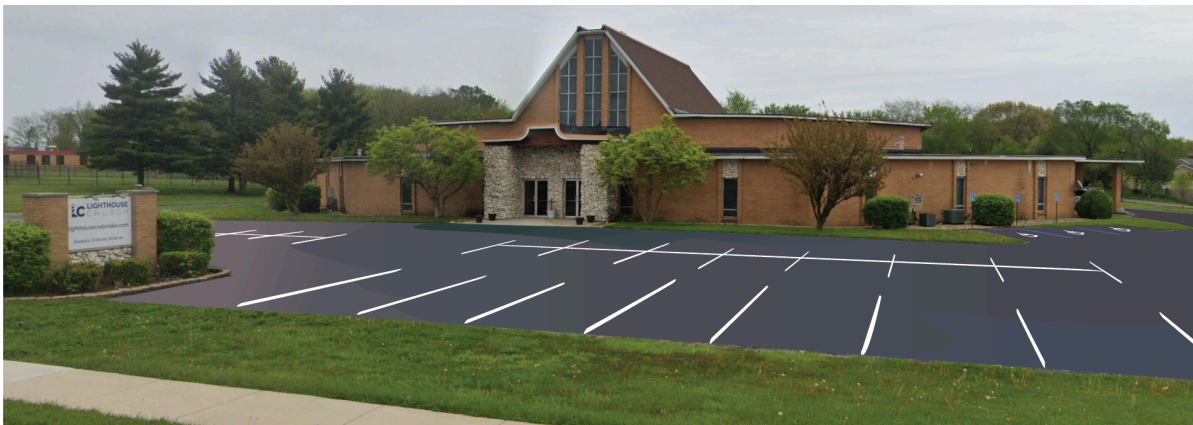
(Artist's rendering of the replaced parking lot)

Goal 3, totaling $200,000, represents the cost to make interior improvements including: